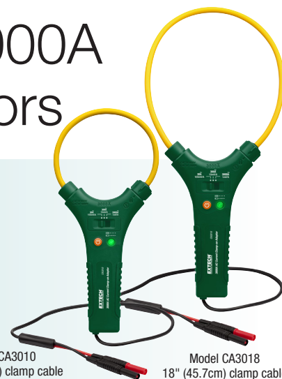
Model CA3010 10" (25.4cm) clamp cable

Expand your meter's capabilities to measure AC Current up to 3000A. Fit most MultiMeters or Clamp Meters with standard shrouded banana plug sockets. Flexible clamp jaw easily wraps around bus bars and cable bundles where standard clamp adaptors and meters can't. The thin 7.5mm cable diameter easily fits into tight spaces. Choose between a 10" (25.4cm) or 18" (45.7cm) clamp cable length.